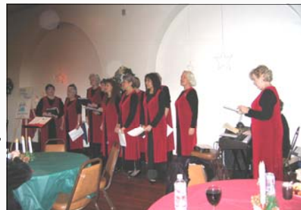
Membership Holiday Potluck, 2008

It is amazing that we spend the last two months of the year celebrating. Here we are midst the worst crisis that most of us have every experienced as far as our economic well being is concerned and we celebrate – and well we should! It reminds me of a song from perhaps a quarter of a century ago when all that was sung without accompaniment was “BE HAPPY” and if you weren’t happy, the song made you happy.