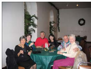
Membership Holiday Potluck, 2008

ponder, “I am alive. I can move, I can see, I can think, I can drive my car, eat, sleep and communicate with others. I can attend church, I can pray, I can give to others.” These alone are things for which to be thankful. But there is so much more. I am a part of this wonderful little museum. I can watch it