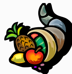
See Greetings, Page 3

We must not forget the wonderful parades and celebrations that we have here in Benicia. When I first moved here I was told by a friend that Benicia finds reasons for parades that other cities would not think of.