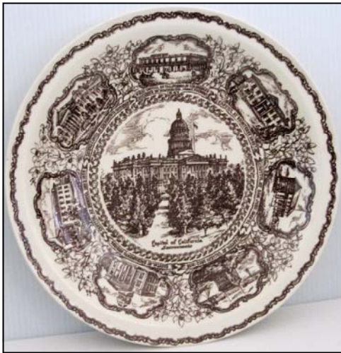
California Centennial Commemorative Plate