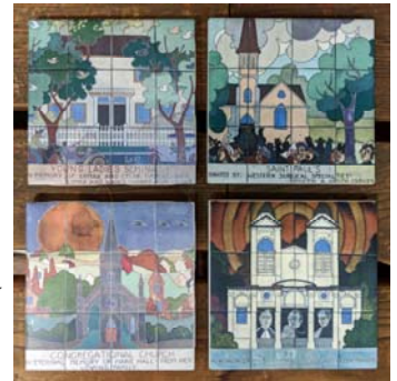
Granizo coasters — 4-piece set

On February 18 th , the Museum once again hosted the Benicia Public Library/First Tuesday Poets Love Poetry Contest Awards , for which we display a tribute exhibit commemorating the tragic love story between Conception Arguello and Nikolai Rezanov. Celebrated by the Museum since 2003, this historical drama has supplied literary inspiration for many, including an ever-expanding pool of contest entries, attracting poets from all over the Bay area and beyond.