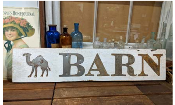
Repurposed barn wood sign