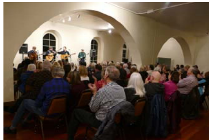
The Black Irish Band perform in Stone Hall