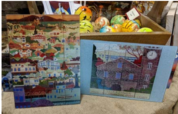
Cutting boards and magnetic frames